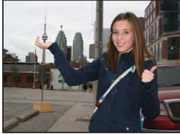
The Grade 10 class enjoyed a week discovering Toronto and seeing how the urban physical needs of others can be so different from their own but the spiritual needs are so very similar