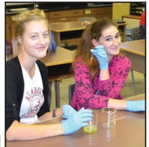
Twin day! We spend so much time together that we start looking like each other!