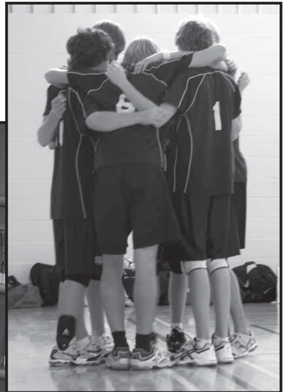
Senior boys volleyball